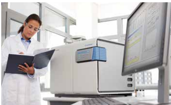
Figure 1. Thermo Scientific FlashSmart Analyzer.

The globalized market for food products requires accurate control of product characteristics in order to protect commercial value, to safeguard consumer health and manufacturer reputation. Official regulations establish protein content and labelling requirements, which enable consumers to define price and make quality comparisons. This means that protein analysis is an issue of significant economic and social interest because of the legal, nutritional, health, safety and economic implications for the food and animal feed industries. A common test used in the production process to determine the protein content is nitrogen analysis which is periodically monitored.