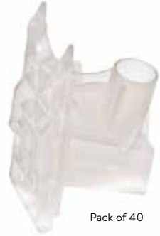
Pack of 40

Double sample holder with card (up to 1ml)