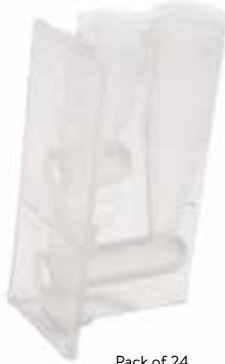
Pack of 24

Single sample holder with card (up to 1ml)