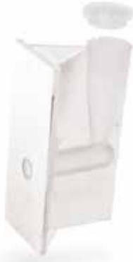
Pack of 24