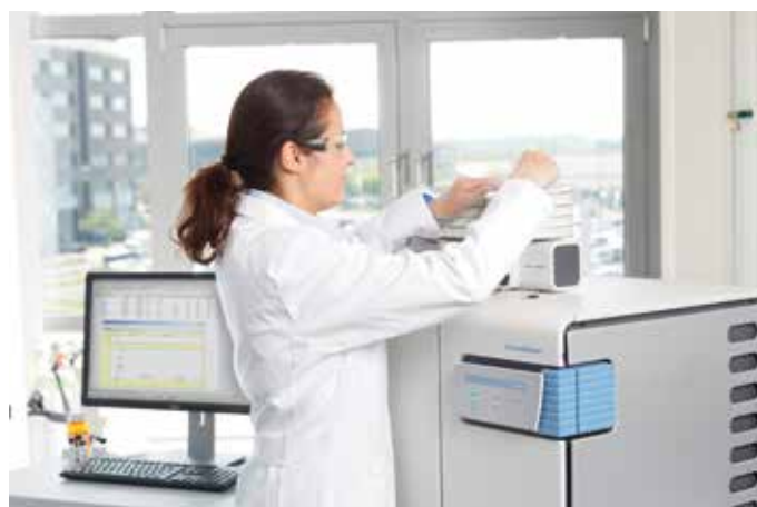
Figure 1. Thermo Scientific FlashSmart Elemental Analyzer.

Carbon, nitrogen, hydrogen and sulfur determination by combustion analysis are used in the characterization of raw and final products in pharmaceutical, cosmetics, universities and material industries for quality control and R&D purposes. The use of accurate and automated analytical techniques allow fast analysis with an excellent reproducibility whilst meeting laboratory demands for high productivity and low cost per analysis. The Thermo Scientific™ FlashSmart™ Elemental Analyzer (Figure 1) is equipped with two independent furnaces that allow the installation of two analytical circuits. These independent circuits can be controlled automatically through the Thermo Scientific™ MultiValve Control (MVC) Module (Figure 2). This unique Module allows the Analyzer to be set-up for ultimate productivity by having an automated CHNS/CHNS configuration in one system. Each analytical circuit can receive its own autosampler.