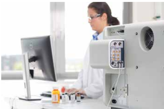
Figure 2. Thermo Scientific MVC Module.